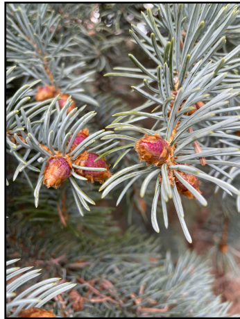
Female strobili on Picea pungens

The Male strobilus is composed of many microsporophylls , which bear microsporangia containing microspores, which go on to develop into pollen. The male strobili wither after releasing pollen.