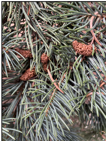
Male strobili on Picea pungens