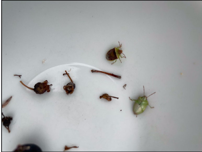
Banasa or Stink Bug (the green one is upside down)

In the summer of 2021, I had a HUGE infestation of Banasa (Stink Bug) in my very mature Amelanchier (saskatoon) bushes. The saskatoon bushes are over 20 years old. I had never encountered this before. The bush is right beside an old stressed Juniper. The Juniper had a tough time in 2021 and is looking much better in 2022.